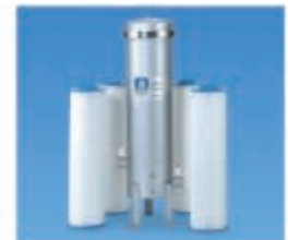
Jumbo Cartridge Housings