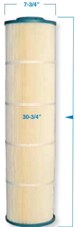
Hurricane® Cartridge Length and O.D.

**recommended flow for maximum chlorine removal