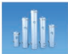
Multi Cartridge Housings