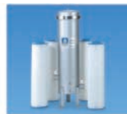
Jumbo Cartridge Housings