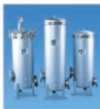
High Flow Multi Cartridge Housings