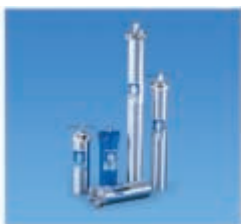
Single Cartridge Housings

Shelco manufactures a full line of filter housings. From our rugged single element housings to our heavy-duty multi-rounds and bag housings, we have the right filter for your requirement. Shelco is the perfect choice for your problem solutions.