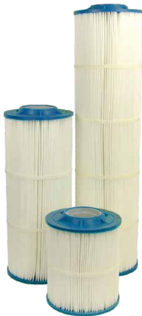
Premium Hurricane® Harmsco-Free Cartridges