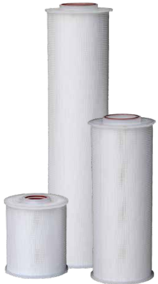
Premium Hurricane® All-Poly Cartridges